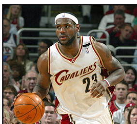
LeBron James, Cleveland Cavaliers

Because of all sorts of media today, from television to radio to the internet, children are constantly being bombarded with "lifestyles of the rich and famous". We, as Dream Builders are always seeing the next "Le Bron" or "50 cent" or "lil Wayne" or "Hannah Montana". The truth of the matter is that these children sometime cannot rap or rhyme to save there lives, or cannot shoot the ball straight if we drew them a line. We have to find a way to ground the children.